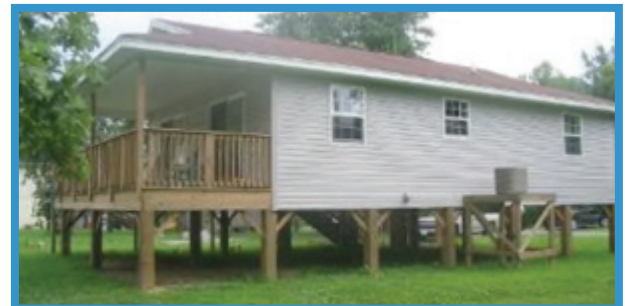
Example of residential home elevated